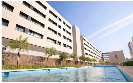
1- UNIVERSITY VILLE