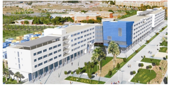
2- IMAGE OF VILLE